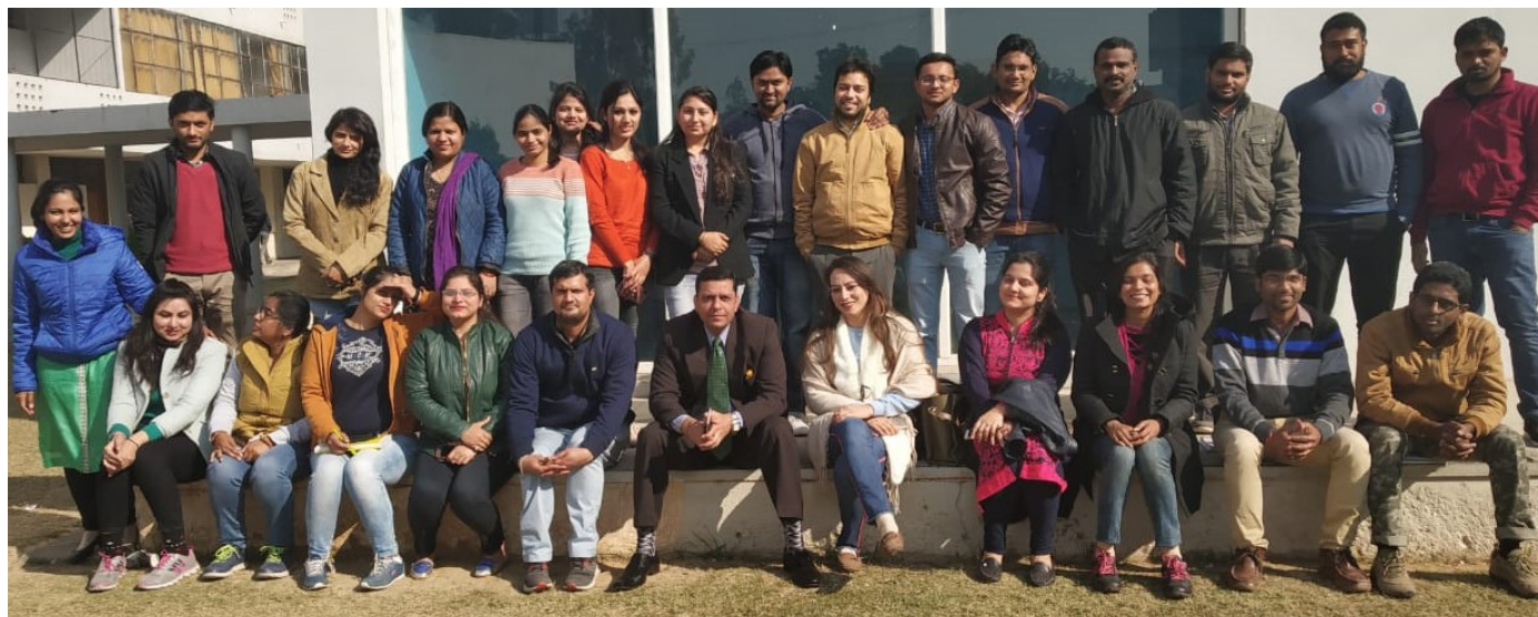
Modular Batch Students